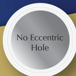
No Eccentric Hole