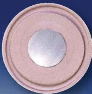
PolySteel Orifice Plate 1