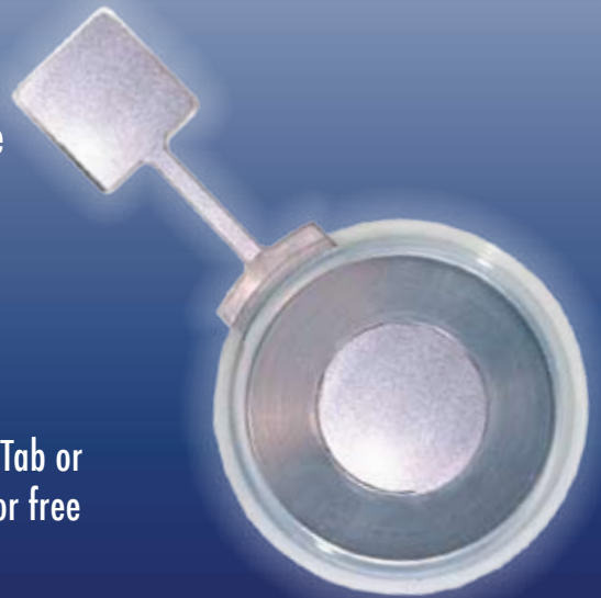
Tabbed Platinum Silicone Orifice Plate 1

Orifice Plate gaskets can be bought with a Right Angle or Straight Tab or with a round plate. Holes can be included eccentric or concentric for free draining in horizontal pipelines. All FlowSmart high quality elastomers are available including PTFE and Stainless Filled PTFE materials that are bonded to the stainless steel plate.